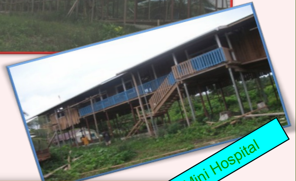
Nila Mini Hospital