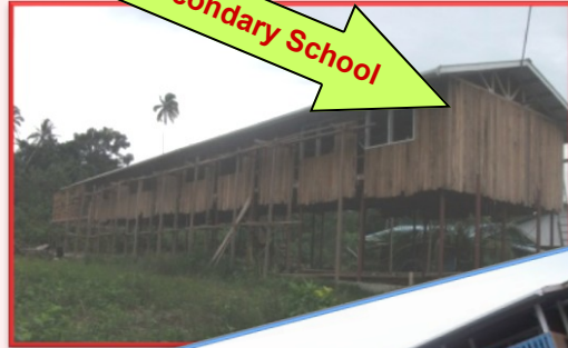
Moli Senior Secondary School